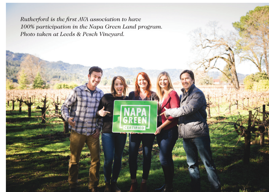
Rutherford is the first AVA association to have 100% participation in the Napa Green Land program. Photo taken at Leeds & Pesch Vineyard.