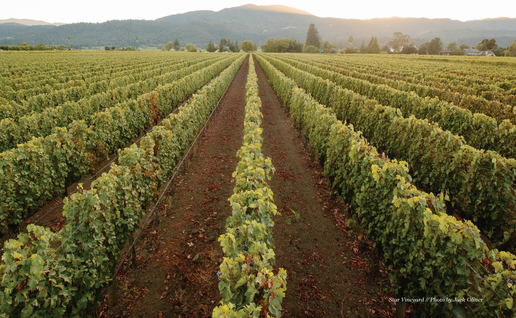
Star Vineyard

Claiming more than 100 years of continuous winemaking in Napa, Rutherford is, without a doubt, the Valley's most historic AVA. Throughout prohibition and the devastation of Phylloxera, the area's wineries – via ingenuity and grit– continued to thrive, helping to pave the way for the Valley's varied wine successes.