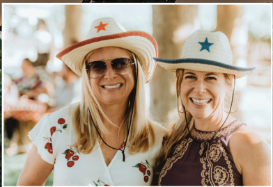
2019 Chili Ball