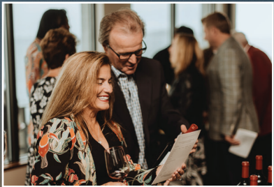
2019 Cabernet by the Bay

RDS, which celebrated its 25th anniversary in 2019, holds two annual events to which the public is invited to attend. ‘Cabernet by the Bay’ Grand Tasting featuring the Rutherford AVA wines of more than 30 vintners will take place July 16, 2020, at the St. Francis Yacht Club in San Francisco. The Original Rutherford Chili Ball is scheduled for August 2, 2020. This often sold-out harvest season gathering features a lively chili cook-off between vintners, firefighters, and local chefs, with live music, a silent auction, and fun activities for children. Visit rutherforddust.org for further information.